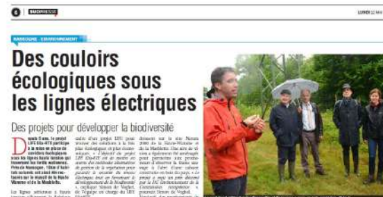
Les pays européens prennent exemple

at the same time, a school visiting a pond and the observation point in a corridor crossing the forest, with the press