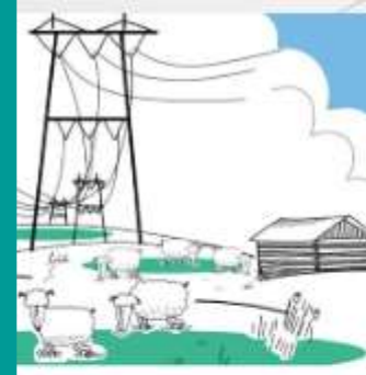
1. MAISEMAN HOITAJINA Grazing animals are an efficient way to manage nature