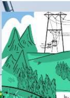
9. KATAJANMARJAA, LEIKKOKHAVU... Hawthorn berries, hay