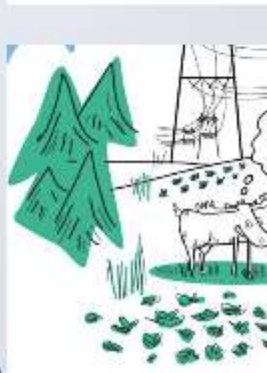
6. RIISTAELÄIMET TÄHTÄIMESSÄ Place for game animal hunting