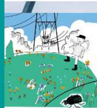
7. RIISTO, MAISEMAN AARRE Game animals are a treasure of the landscape