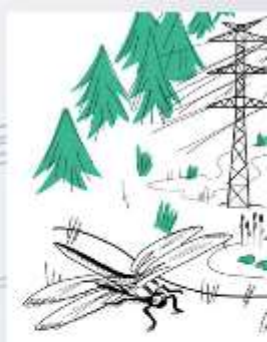
3. KOSTEIKOILLA MONIMUOTOISIA Biodiversity in wetlands