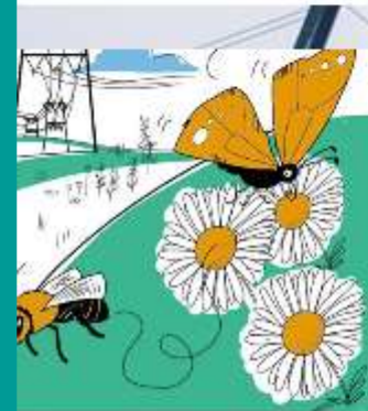
4. PÖLYTTÄJÄT Pollinators are a habitat for demanding plants