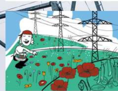
5. VILJELLEN HERKKUJA TAI SILMÄNILOA Garden delicacies or eye-catchers from the garden