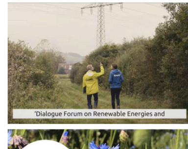
'Dialogue Forum on Renewable Energies and